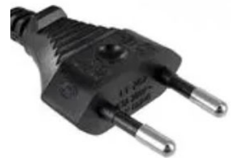
CEE 7/16 Plug