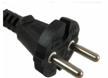
CEE 7/17 Plug