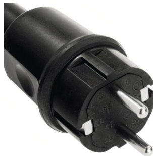
CEE 7/4 Plug