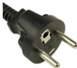
*CEE 7/6 Plug