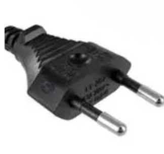
CEE 7/16 Plug