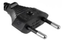
CEE 7/16 P