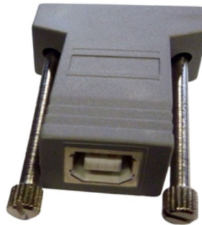
CONN358 USB2.0 Type B to DB9(F)