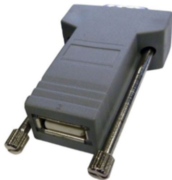
CONN357 USB2.0 Type A to DB9(M)