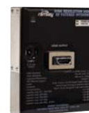
HDMI 4K Video