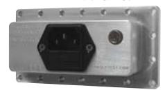
Global Power Interface