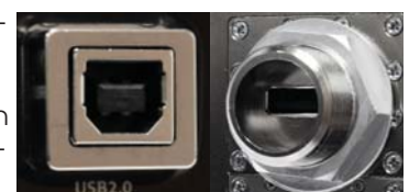
Solid milled USB connector protection!